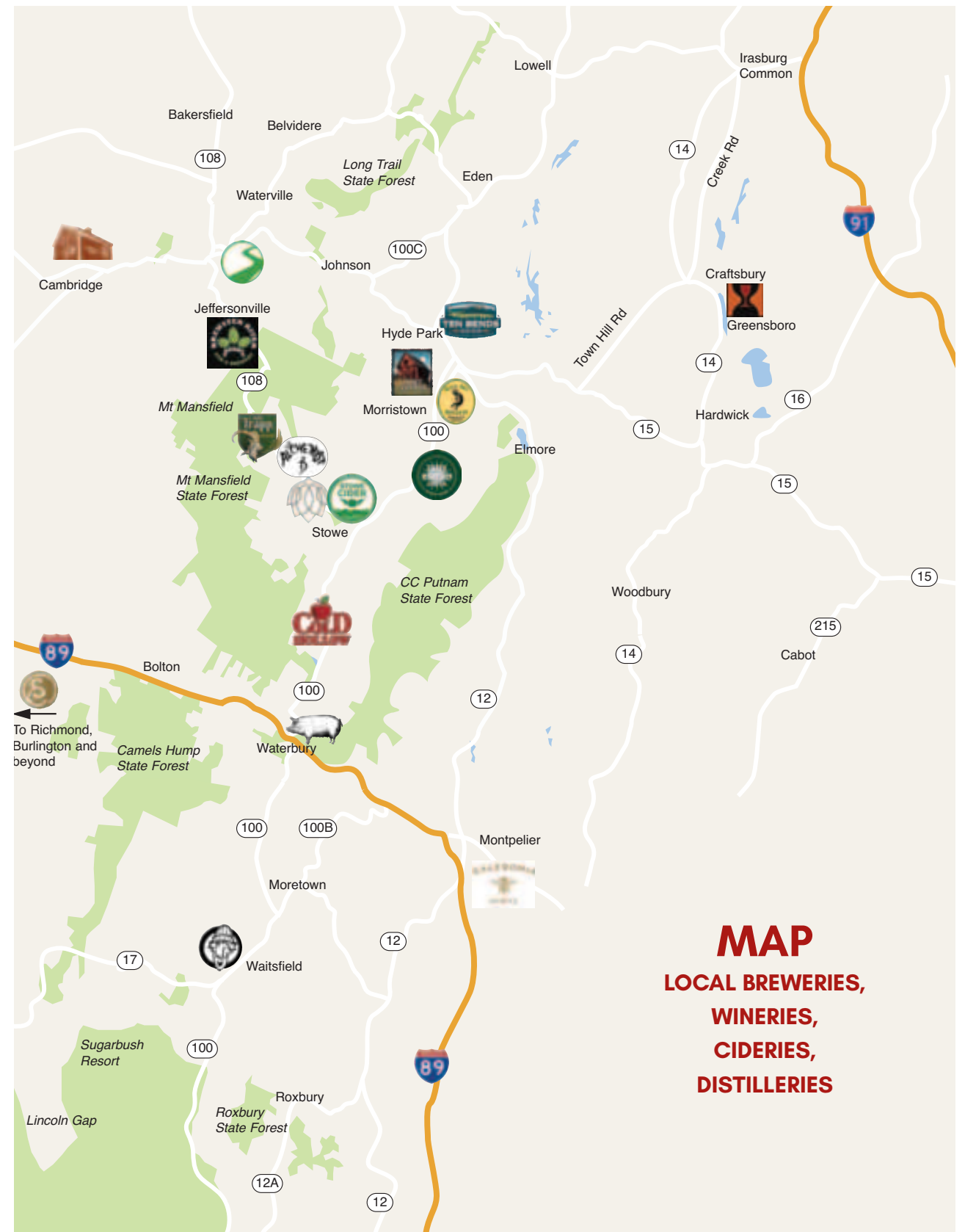
MAP LOCAL BREWERIES, WINERIES, CIDERIES, DISTILLERIES