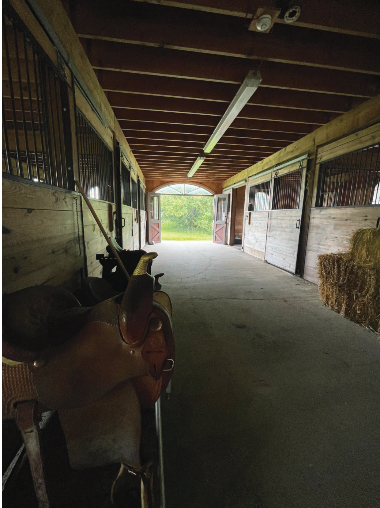
So, we designed and built a 6-stall equestrian barn fit for our four-legged stars, replete with large common area, heated tack room, heated bath and shower, coffee room, and more.